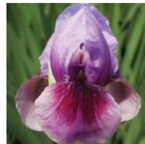
Shabaza 01 Arilbred