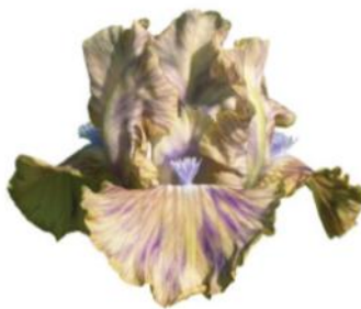
Little Streaker 09 SDB