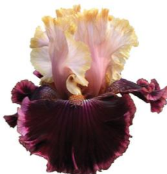
Raspberry Swirl 09 TB