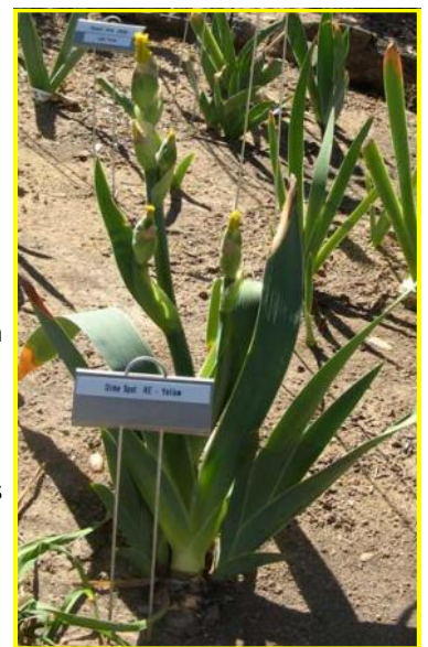
Dime Spot—Carolyn Alexander

I also have some beds in order for a reason, like my reblooming iris bed. It is a good idea to keep your rebloomers together because of the extra food needed to. I never had many to put together until this summer when I purchased about 20 reblooming iris rhizomes. This new bed is now called "Again & Again". Easy to remember since they bloom again. Currently "Raspberry Frost" is blooming (photo page 4) and "Dime Spot" is about to open. This bed was just planted in August so I think that's pretty good to have these blooms so quickly.