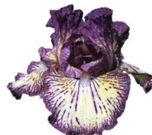
Fall Line 09 IB