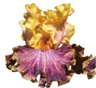
Fruit Stripe 09 BB