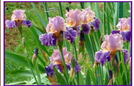
Iris in the garden at the International Iris Competition Florence, Italy