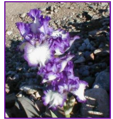
Bountiful Harvest Hager '91 TB Candy Peters