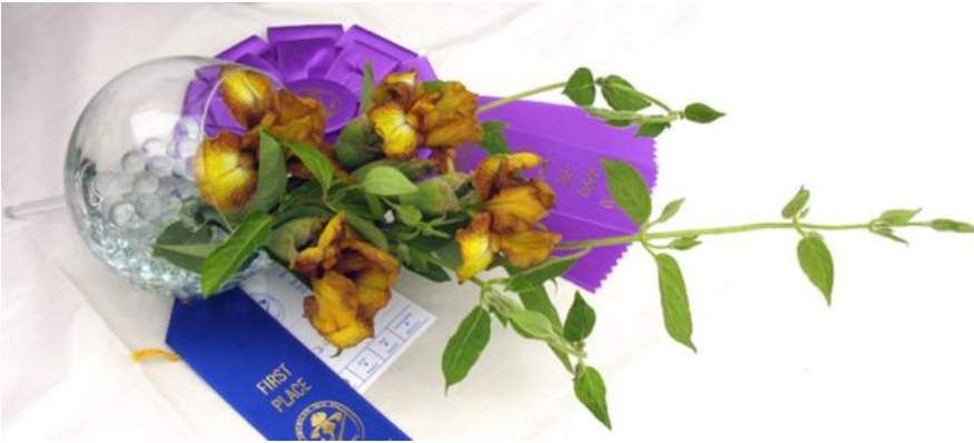
Best Design of Show Section A: Diane Clarke Butter Pecan Hager '83 Artistic Design Sweepstakes