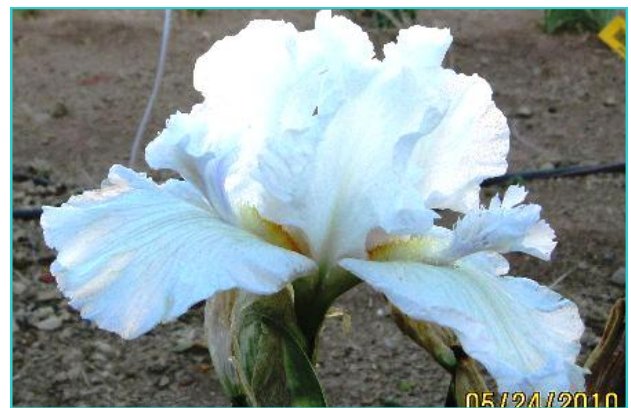
Mesmerizer Byers '91