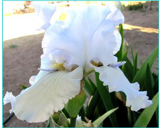
Alabaster Unicorn Sutton '96

Ed. Note: Fertilize again after the bloom is done, cut bloom stalks off and continue to keep ahead of the weeds.