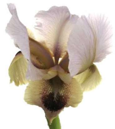
Best Seedling: Doris Elevier LD2008a