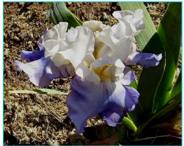
Stairway to Heaven Lauer '93