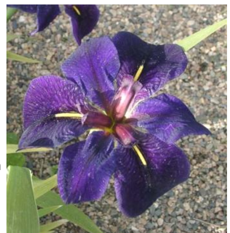
unidentified Louisiana iris

"The Louisiana irises constitute a unique group in the iris family. Among all the irises, Louisiana's are most unique in color and in form. They exhibit an incredibly broad range of color and are considered very significant in providing the color red to the iris spectrum. An equally wide variety of forms, when combined with the color range, make for truly great horticultural opportunities." From the Louisiana Iris Society website: http://www.louisianas.org/cultivars/cultivar1.html