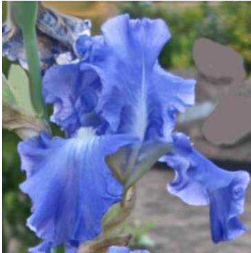
Victoria Falls Schreiner '77, DM '84

It has been a productive and wonderful display of color at the Sculpture Garden this year. The iris have put on a show of beautiful blooms over a very long period. Would you believe, this year we have had three iris blooming into late October. "Victoria Falls" found in the Dyke's medal winning section of the garden, had a stock with over 20 gorgeous blooms and buds that put on a display from September 15 th through the month of October. "Marty Richards" also performed in the same manner. Cherie is also rebloomng, but is not as prolific as Marty Richards and Victoria Falls. It was a great year in the gardens and PAIS owes so much to the many members who helped us plant and maintain these iris beds.