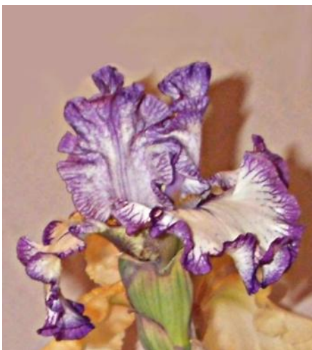
Autumn Ring—Nancy Floyd Camp Verde