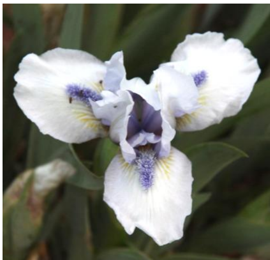
Autumn Surge SDB —Gerry Snyder Sedona