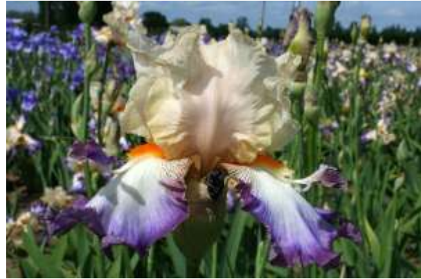
“Wings At Dawn”, winner 2013 Iris Naming Contest