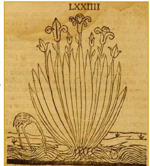
Iris from Herbarius Latinus, 1509

In medicine iris were used in the treatment of diseases of the lungs, blood and stomach disorders. It is said that the oil of iris could remove freckles from the skin. In ancient Greece druggists and doctors were known as rhisotomi (root diggers). Our current term for the iris root rhizome is derived from this Greek word. Irises were so highly prized in ancient Greece that Pliny stated that iris should be gathered only by those in a state of chastity. Thank goodness we do not have to hold to that restriction today!!! Stay tuned for another exciting iris adventure in the iris history corner in our next issue.