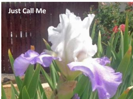
Just Call Me