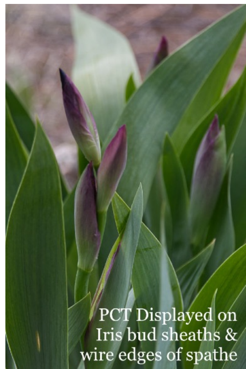
PCT Displayed on Iris bud sheaths & wire edges of spathe