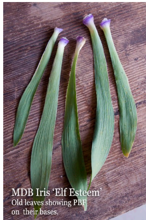
MDB Iris 'Elf Esteem' Old leaves showing PBF on their bases.

Historic irises are targeted, but irises of any age are accepted . HIPS very much encourages PBF/PCT observations be made when the iris clump is in spring bloom, which is anytime from bud emergence until end of bloom. (This helps verify the clump is what you think it is.) However, alternate out-of-spring-bloom observations are now accepted, including early spring and summer observations. Please withhold late fall and winter observations. The main counts and data analysis are made using in-spring-bloom data only. We will assume an observation is made when clump is in-spring-bloom unless you advise us otherwise so please advise when needed!!! Out-of-spring-bloom data will be noted in a separate column in the Cumulative Report and given no special count or analysis.