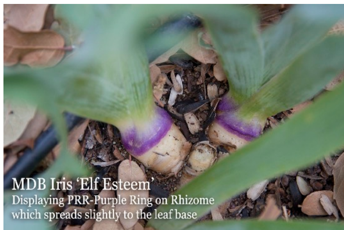
MDB Iris 'Elf Esteem' Displaying PRR-Purple Ring on Rhizome which spreads slightly to the leaf base