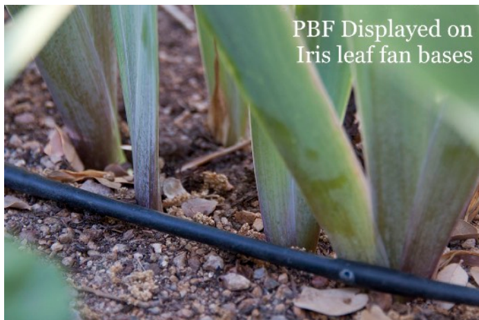
PBF Displayed on Iris leaf fan bases